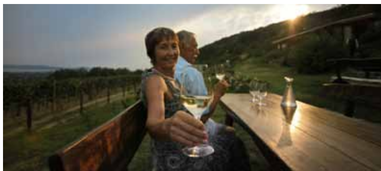
The Tokaj wine region

age Sites. And there are also the Hungaricums, our Hungarian specialties: “pálinka”, Unicum, sweet paprika or salami; tasting them is a must, but they also make perfect souvenirs. And - no nonsense, no mistake - dessert is a must after dining. In order to taste them visit the Hungarian “cukrászda”s, i.e. confectioneries: these are charming little shops,