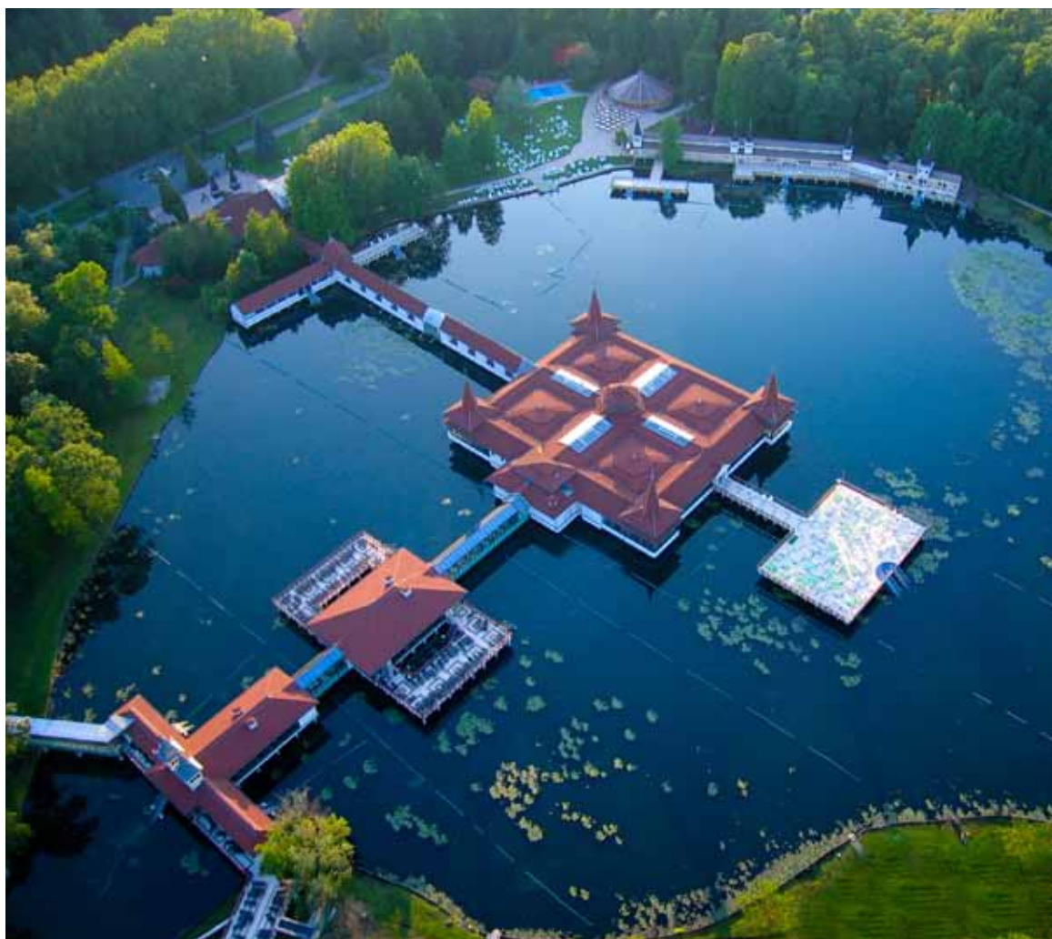
Hévíz from above

of humidity. One of these caves, the Jósvalói-barlang (Jósvaló Cave) is part of the Aggtelek National Park and a World Heritage Site. The mofetta (fumarole) is a real rarity in North Hungary; here the natural carbon-dioxide - discharged as a result of the final phase of some former volcanic activity - is used for healing. In the medical and wellness spas