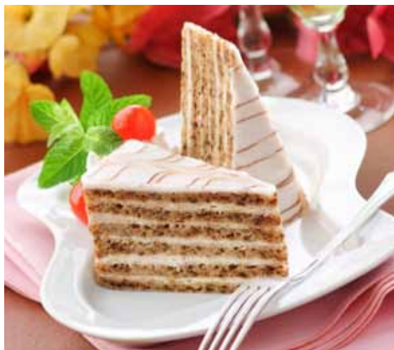
Delicious Hungarian pastries are a must try