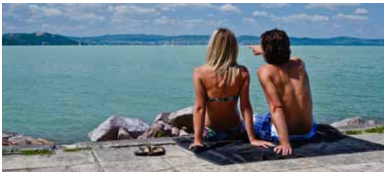
Holiday for the whole family