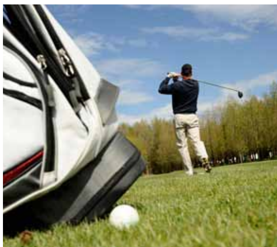
Carefree recreation either in on a golf course or on a yacht

Ring around the lake. Excellent horse trekking routes are available in the territory of the Balaton Uplands National Park. It is also worth visiting one of the numerous adventure parks, where you can try horseshoe tossing, archery, and also the bob-sled track, wire rope slide, paintballing, adventure track or water bumper cars. The Balaton region