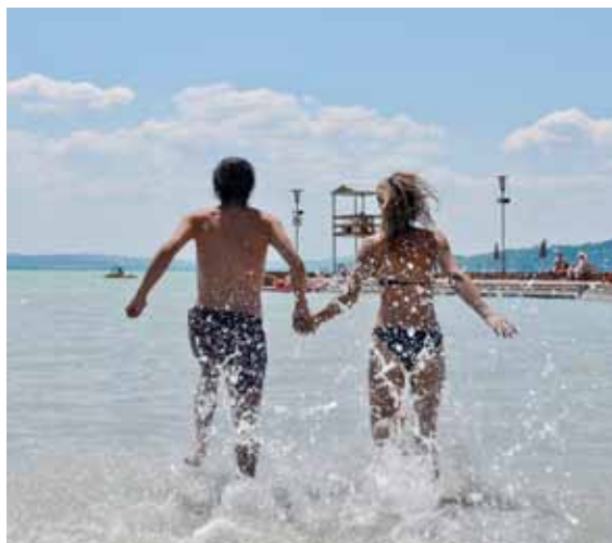
Endless fun on the beaches