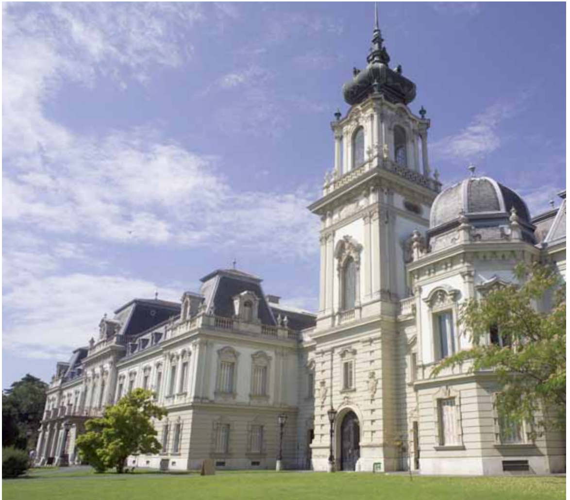
Festetics castle in Keszthely

traditions of medieval warfare at the Castle Games in the summer. Among the memorials of folk architecture, the folk house of Buzsák is renowned for its embroidery, the country house at Vörs, the folk house at Zamárdi and the folk house of Balatonkenese, which was awarded the Folklore House of the Year prize in 2011, are the most outstanding.