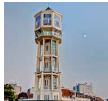
Renovated symbol of Siófok: Water-tower in the centre

day. A particular sight at Badacsonytomaj is the basalt church dedicated to Prince St. Imre.